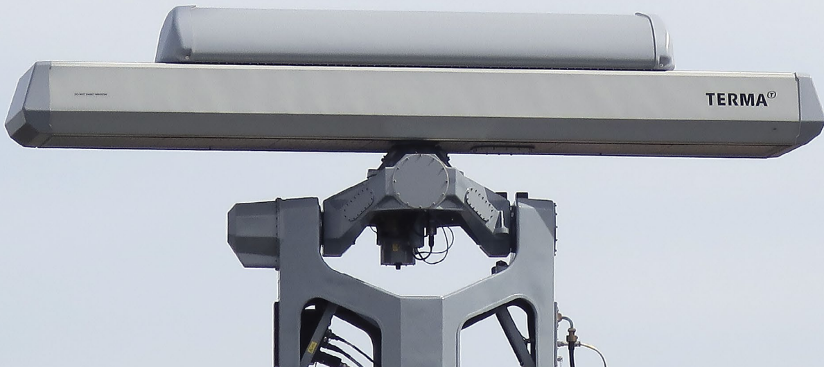
12' Dual Beam High Gain antenna with IFF antenna on a light-weight stabilized platform - one of the available antenna systems