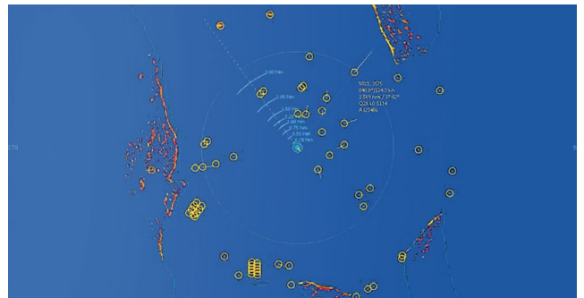
Crisp and clear radar video from SCANTER 4603

Terma has more than 60 years of Surveillance & Mission Systems experience and more than 3,000 radar systems in service worldwide. Navies, Coast Guards, and other high-demanding authorities around the world rely on our high resolution surveillance capabilities for securing the maritime domain and the sea lines of communication.